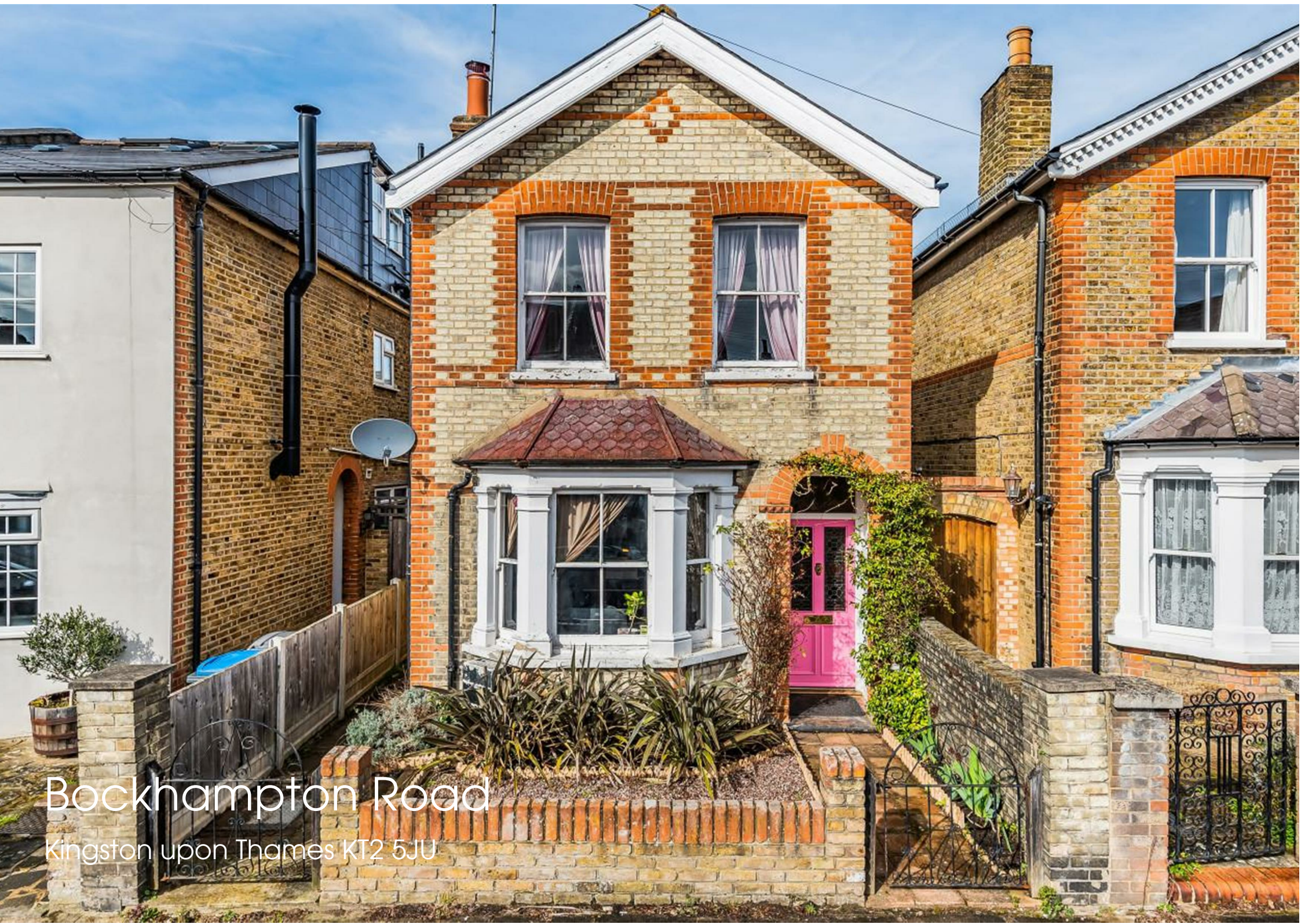
Bockhampton Road Kingston upon Thames KT2 5JU